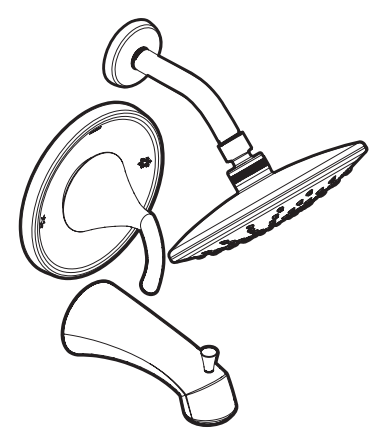
Glyde™ Single-Handle Tub/Shower Trim Kit with Rainshower

Models: T2842EP series - shower trim only