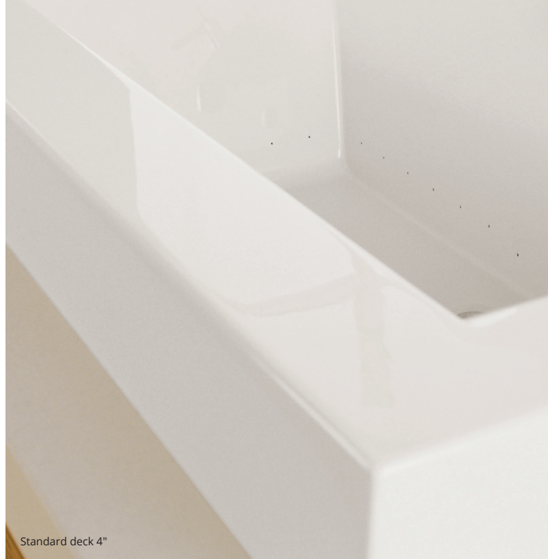
Standard deck 4"